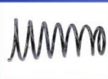
Shock Absorber Spring