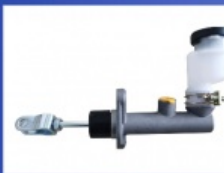
Clutch Master Cylinder