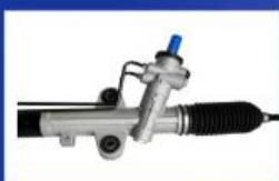
Power Steering Rack