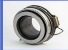
Clutch Release Bearing