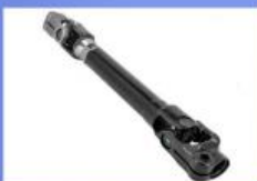
Steering Column Shaft