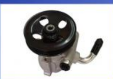
Power Steering Pump