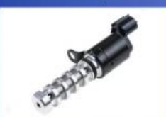
Oil Control Valve