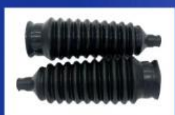
Steering Gear Boots