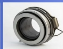
Clutch Release Bearing