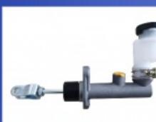
Clutch Master Cylinder