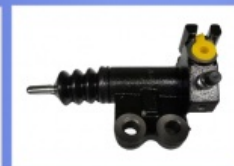
Brake Slave Cylinder