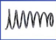
Shock Absorber Spring