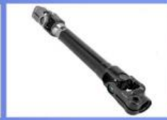
Steering Column Shaft