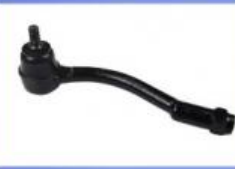
Tie Rod End