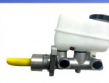
Brake Master Cylinder