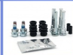
Brake Repair Kit