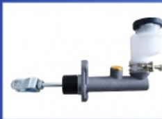
Clutch Master Cylinder